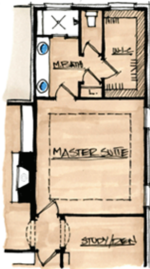
OPTIONAL MASTER SUITE