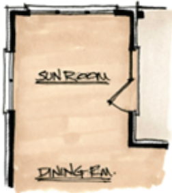
OPTIONAL SUN ROOM 170 sq. ft